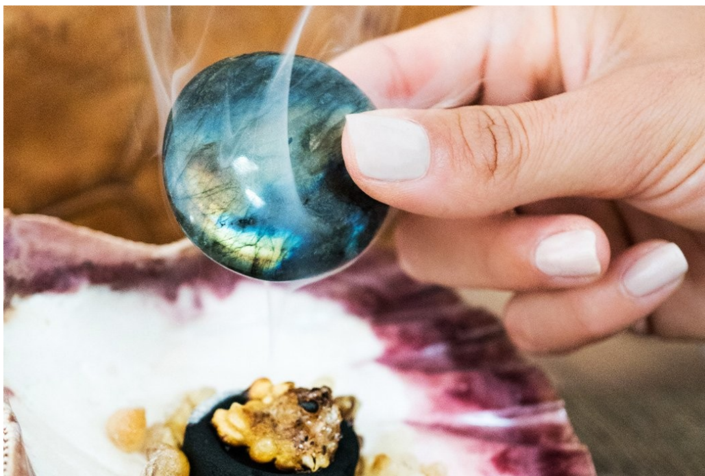
Copal Image from Energy Muse