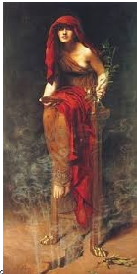
Image Pythia - Oracle of Delphi - John Collier https://www.ancient.eu/Pythia/

It is up to our transgression and gnosis to uncover the bones of the ancient ways and flesh them out.