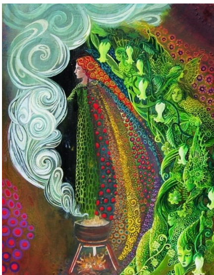
Witches Brew by Emily Balivet

Is known to be The Celtic Smudge of Old. Dried Leaves Sprinkled over a Hot Coal will release The Fragrant Smoke for Ceremony, Purification, Grieving, New Beginnings, Liberation